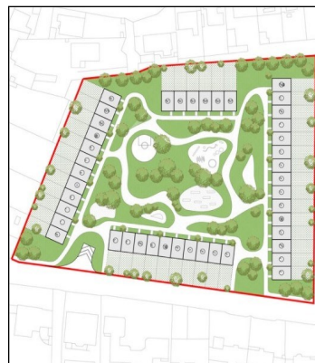
possible model could be the park recently developed on Hudson Rd.

The DLCRA assisted in creating a questionnaire to ascertain the views of local residents – this was distributed door to door and was available online. Over 70 responses were received from 140 questionnaires and the message was clear that the residents favoured retention of the current zoning and its use as a community resource. A