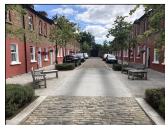
Desmond Ave looking beautiful

During the Covid-19 Lockdown at the start of summer, residents of Desmond Avenue in the centre of Dún Laoghaire undertook a community project to paint the walls, window-ledges, and door surrounds of all the houses on the street.