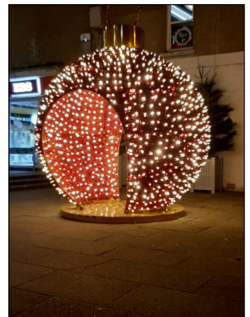
New Christmas Decoration for 2020 replacing the tree outside the Church

A very big thank you to all our customers for your loyalty, support, and custom over the last 30 years,