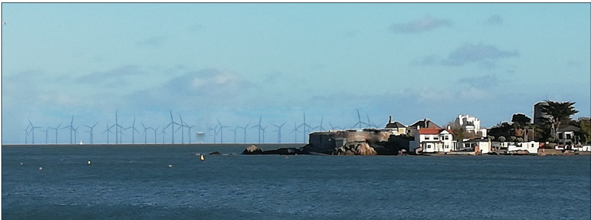
Artist impression of Wind Turbines off the Kish bank over Sandycove

Ultimately Dublin Array would like to start construction in 2024.